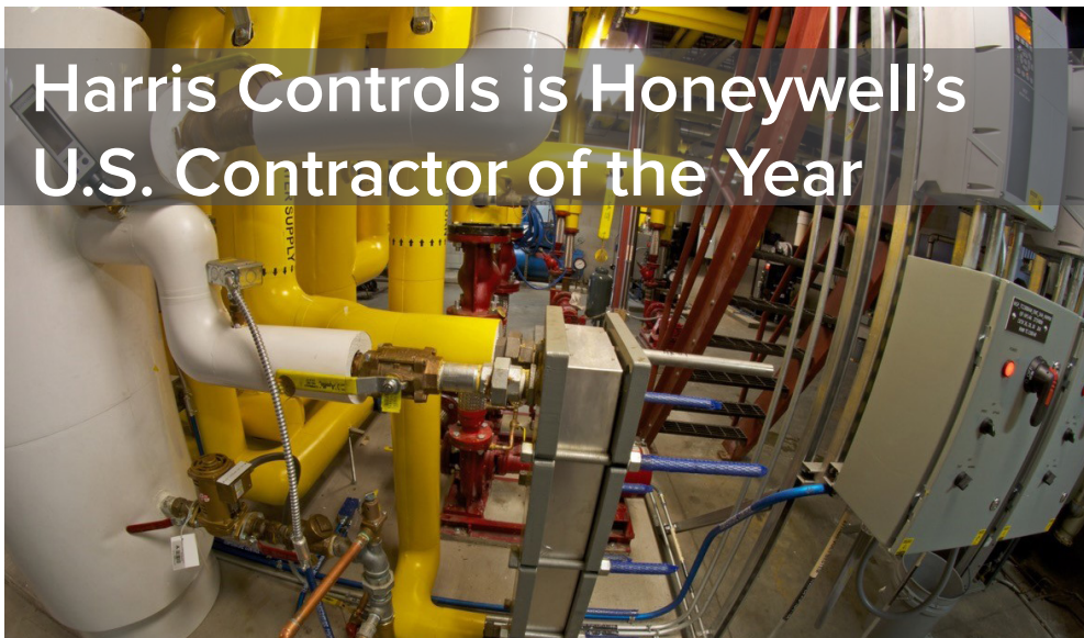
Harris Controls at work in a mechanical room at the Minneapolis-St. Paul International Airport.